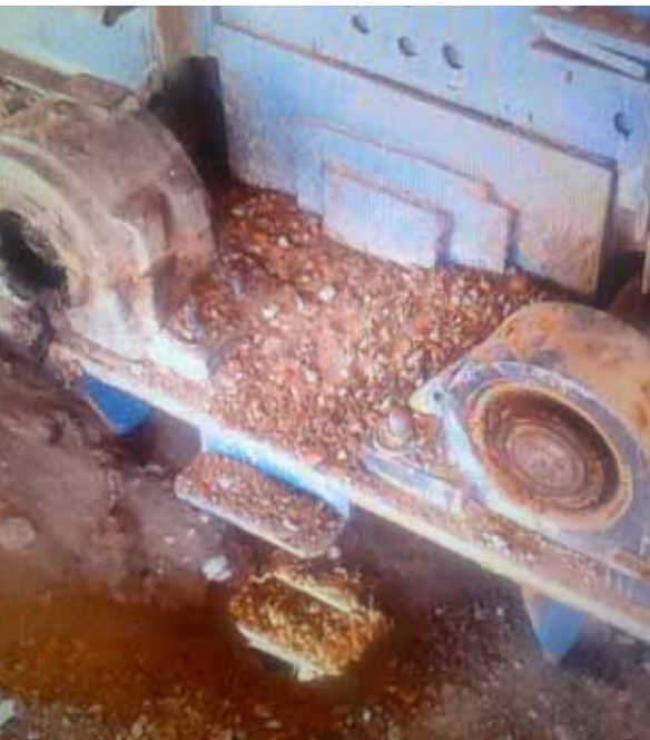
The Timken housed unit displaced a competitor's product (above) in a hammer mill operated by Hanson Brick.

Timken spherical roller bearing solid-block units feature cast-steel housings and durable seals. They provide robust protection from particulate contaminants and severe shock loads, while handling up to \pm 1.5 degrees of misalignment.