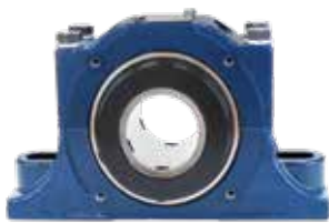
Timken® Type E self-aligning mounted tapered roller bearings.