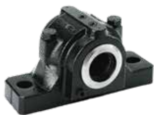
Timken® SAF/SNT split-block mounted spherical roller bearings.