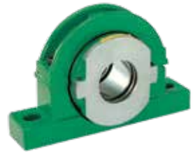
Timken® mounted split cylindrical bearings.