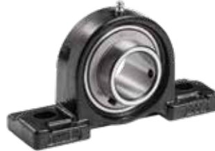
Timken® U-Series mounted ball bearings.