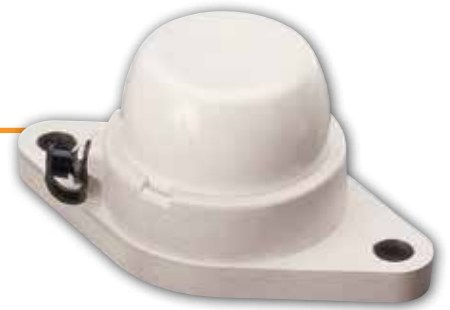
Easy-to-install Timken safety end caps protect exposed rotating shafts, reducing hazards around many types of equipment.

Timken® Survivor® series ball bearing housed units are specially designed and manufactured to excel in the rugged, highly corrosive environments typically found in food processing applications. They are well-suited for any stage of the processing cycle, from the front end where weight and impact are of primary concern to the ready-to-eat end where corrosion resistance is critical. Timken products deliver the performance that's vital to the food industry.